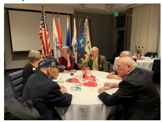
Spirited discussion was held at every table.

You can contact the High Country Chapter of MOAA through the following avenues: