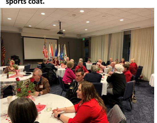
A gathering of friends and lovers.