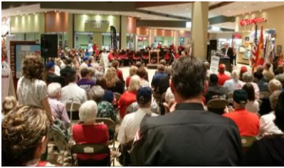
Photos of past programs

As we've done in the past, the High-Country Chapter of MOAA takes pride in honoring and remembering local veterans who have served our nation. In particular, on Memorial Day, we seek to recognize those community members who provided the ultimate cost for their sacrificial service. In preparation for our regular Memorial Day remembrance at the Boone Mall, our chapter will place American flags on veteran gravesites at Mount Lawn Cemetery on the Saturday before Memorial Day, 27 May at 10:00 am. All gravesites marked with the decal of a saluting veteran will receive a flag. Our Boone Mall remembrance ceremony will be held on Monday, 29 May 2023 at 1100am. Finally, our chapter chaplain will officiate a Service of Reflection at the Mount Lawn Cemetery columbarium at 3:00 pm on Memorial Day, 29 May 2023.