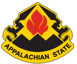
Mountaineer Battalion "Fire on the Mountain"