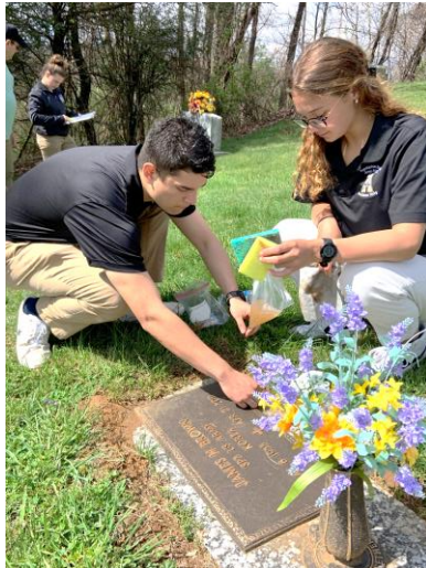
Two cadets mark a gravesite while one checks rosters